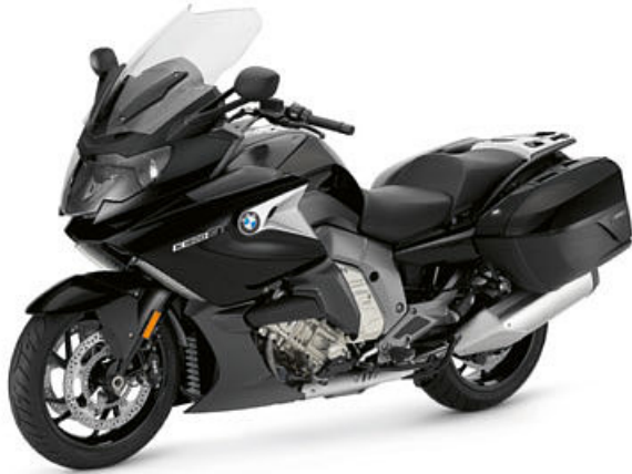
ND2 Paintwork in Black Storm Metallic/Seat in Black/Drivetrain in Platinum