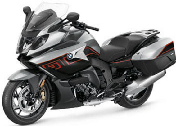
BMW K 1600 GT Sport: ND5 Paintwork in Black Storm Metallic/ Glacier Silver Metallic/Seat in Black/Frame in Asphalt Grey Metallic Matt/Drivetrain in Black